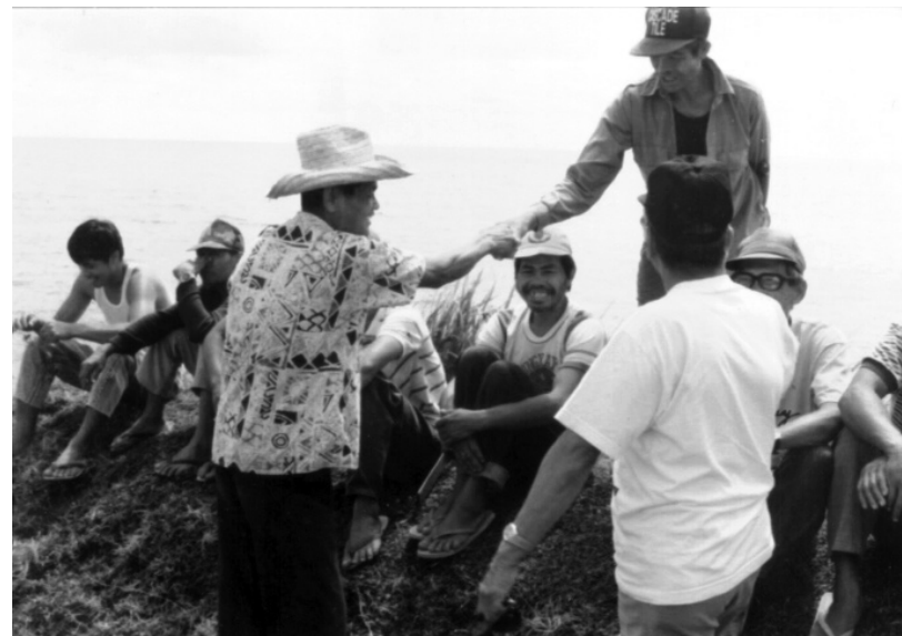
Fig. 5. Potential candidates in local elections shaking hands with mataw fishers, 1992