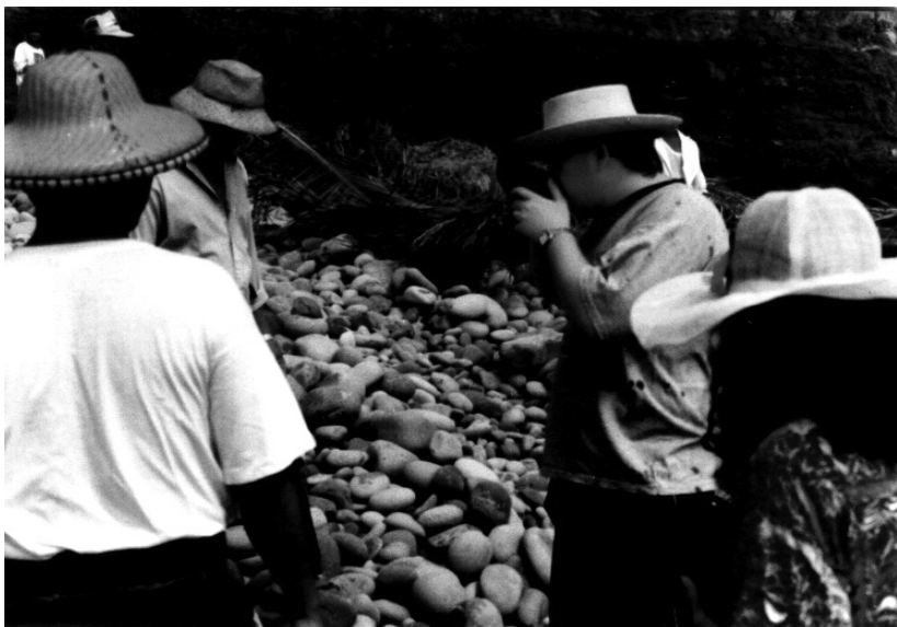
Fig. 4. Scandinavian visitor to Batanes participating in Mayvanuvanua, 1992

Because elections are usually scheduled in May, during election years I always met many of those planning to run for provincial, municipal, congressional, and barangay level positions at Chanpa-n during the Mayvanuvanua held at the beginning of March. In fact, the politicians and visitors possibly outnumbered the fishers themselves at this event (figs. 4 and 5). Their contribution also came in monetary form, and their names were entered in the records of the vanua alongside those of the fishers, together with the sum of