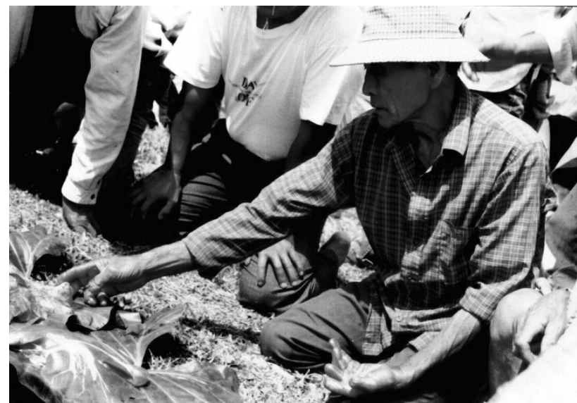
Fig. 3. Ritual expert interpreting the internal organs of the sacrificial animal for omens of the fishing season, 1992

To learn the response or the will of the invisibles, after Mayvanuvana the internal organs of the sacrificial animal are analyzed (fig. 3). From the color of the lungs, the fullness of the gall bladder, and the texture of the liver,