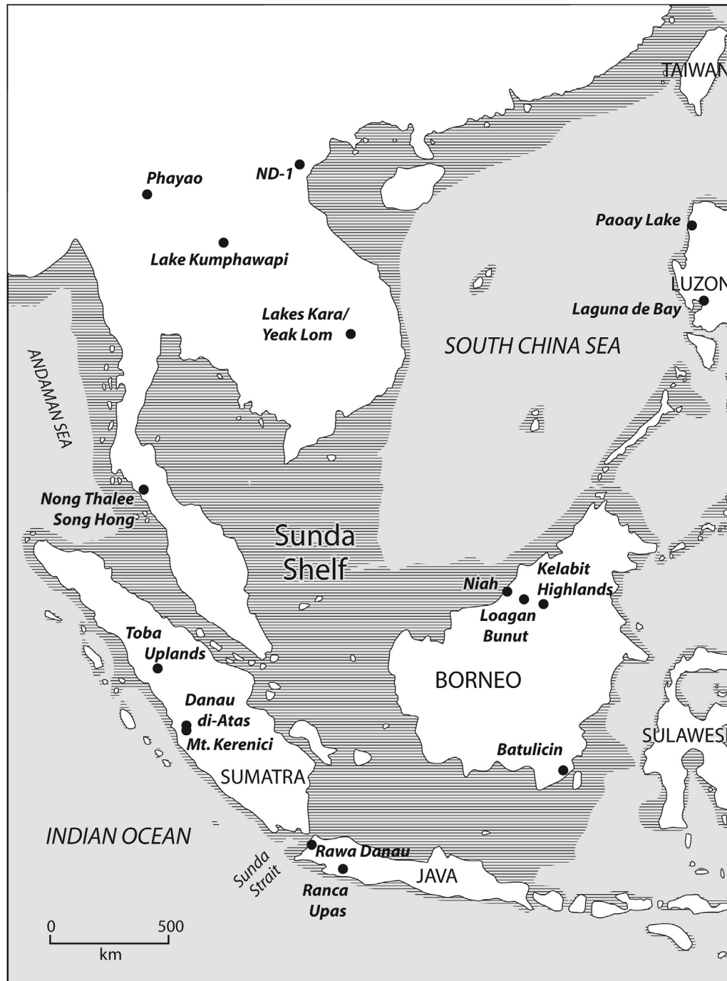
Fig. 1. Location of Early Holocene sites reviewed in Table 1.

example of the application of European-influenced Neolithic models has been the ‘Austronesian Hypothesis’ (e.g. Bellwood, 1985, 1988, 1997, 2005, 2011; Diamond, 2001; Diamond and Bellwood, 2003; Spriggs, 2011) where apparently convergent linguistic and archaeological evidence was interpreted to indicate a diaspora of Austronesian-speaking, rice-growing agricultural people from Taiwan some 5000 years ago. These people are argued to have spread across many of the islands of the Sunda Shelf – the great archipelago of Island Southeast Asia (Fig. 1), acquiring tree crops and losing rice on the way, before dispersing further to Madagascar and across the Pacific Islands. The hypothesis has been